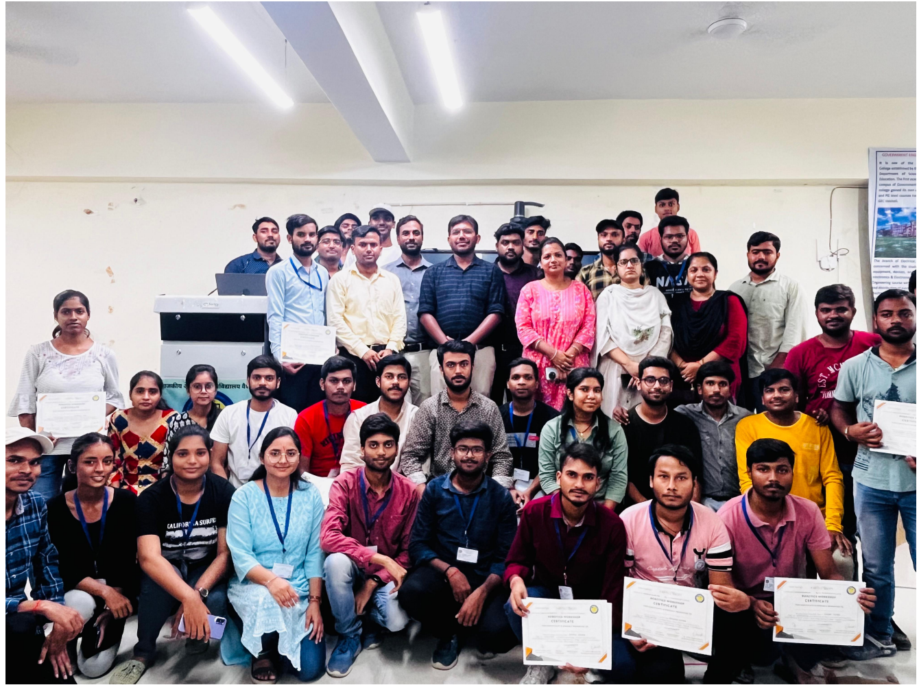
Photo session with participants & Volunteers after Valedictory session on 31st July 2024