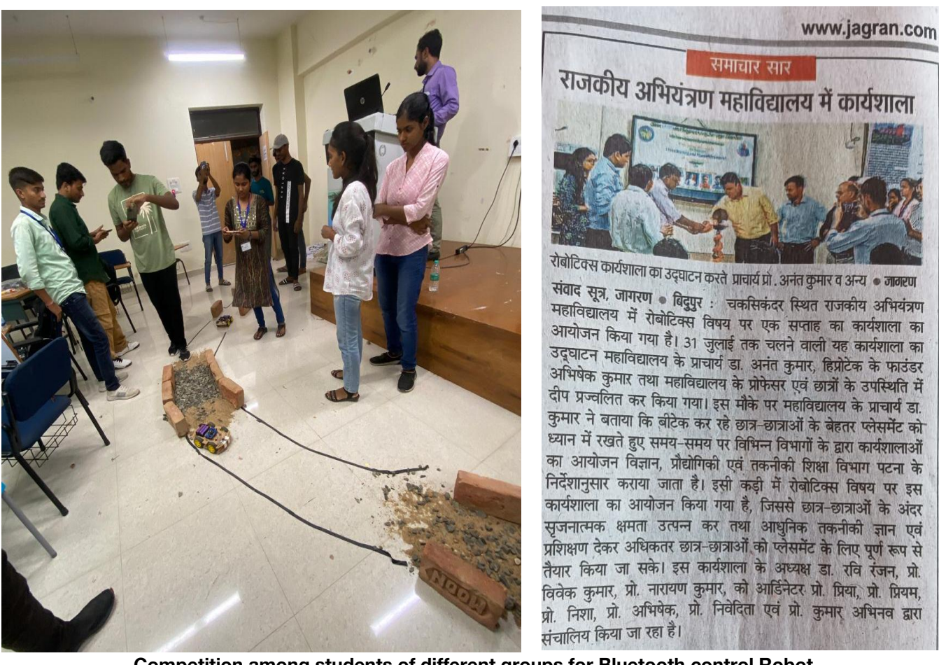
Competition among students of different groups for Bluetooth control Robot