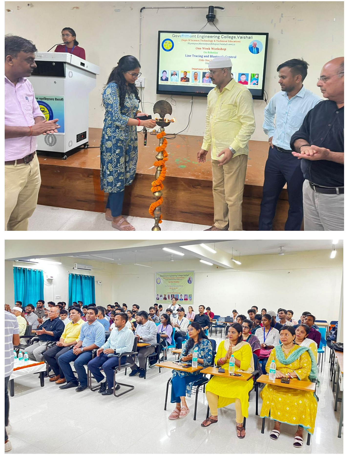
Inaugural Ceremony of Robotics Workshop on Line tracing and Bluetooth Control on 25/07/2024