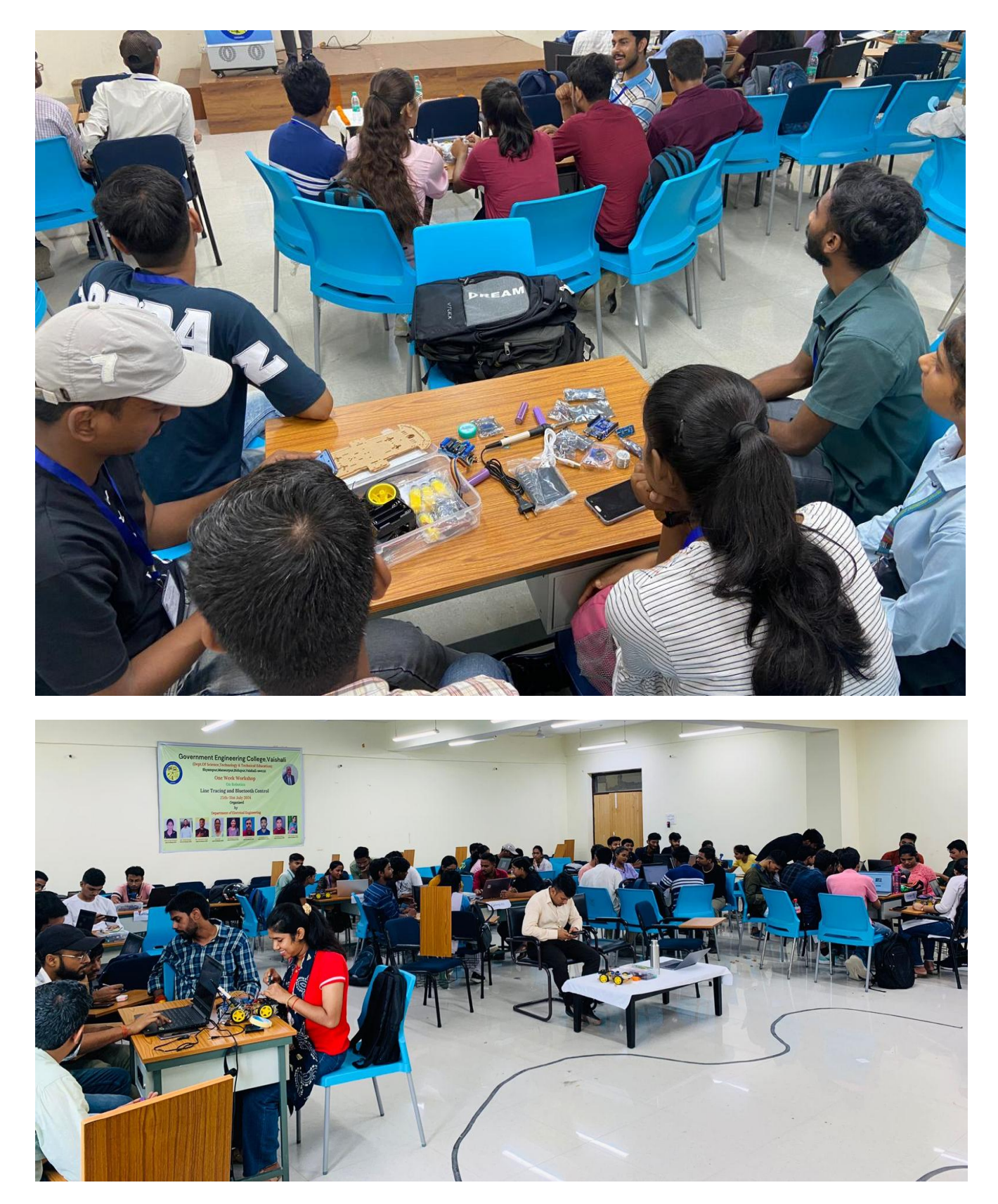
Hands on Training on Automatic Bluetooth Control robot