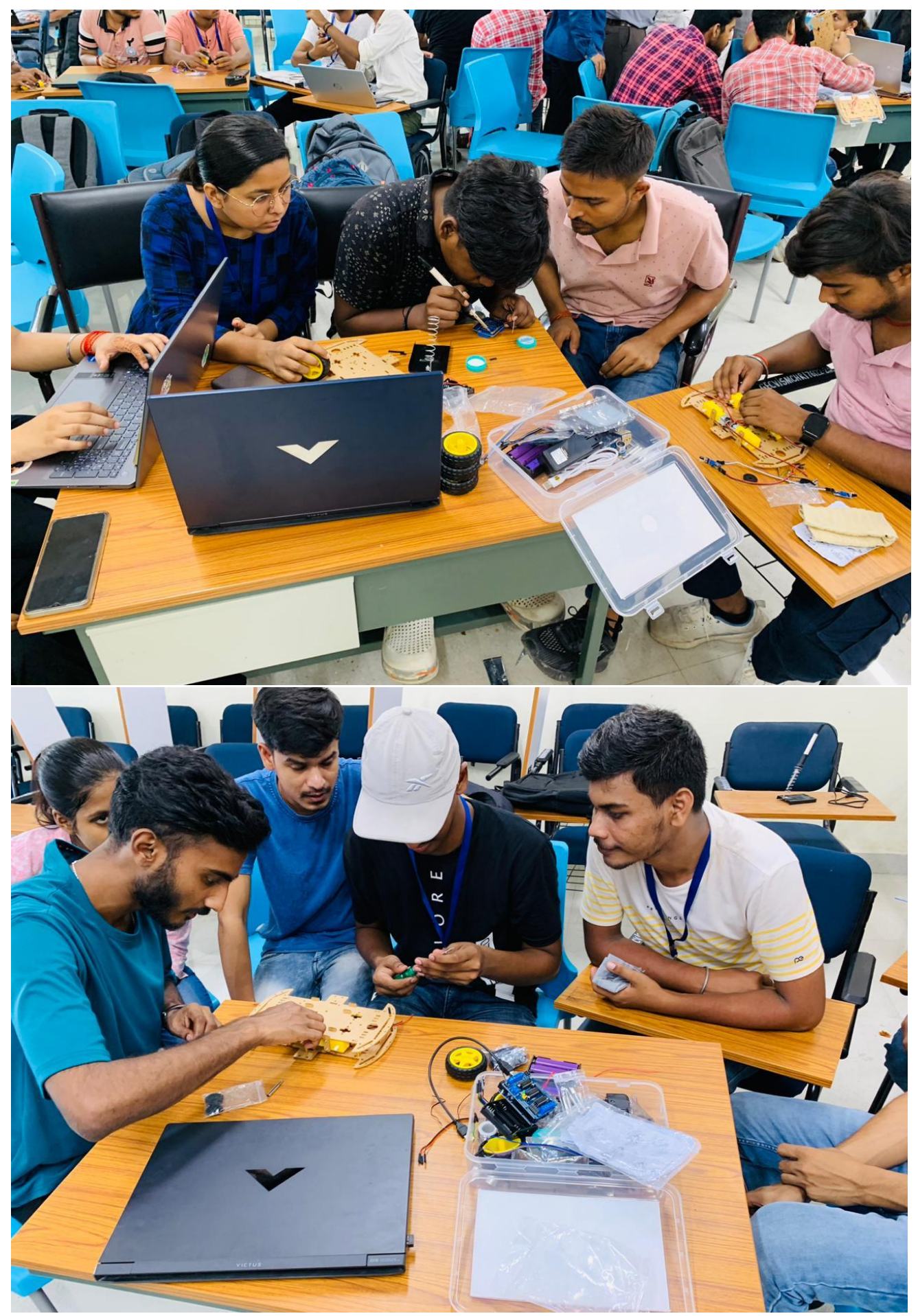
Hands on Training on Automatic Path tracing robot