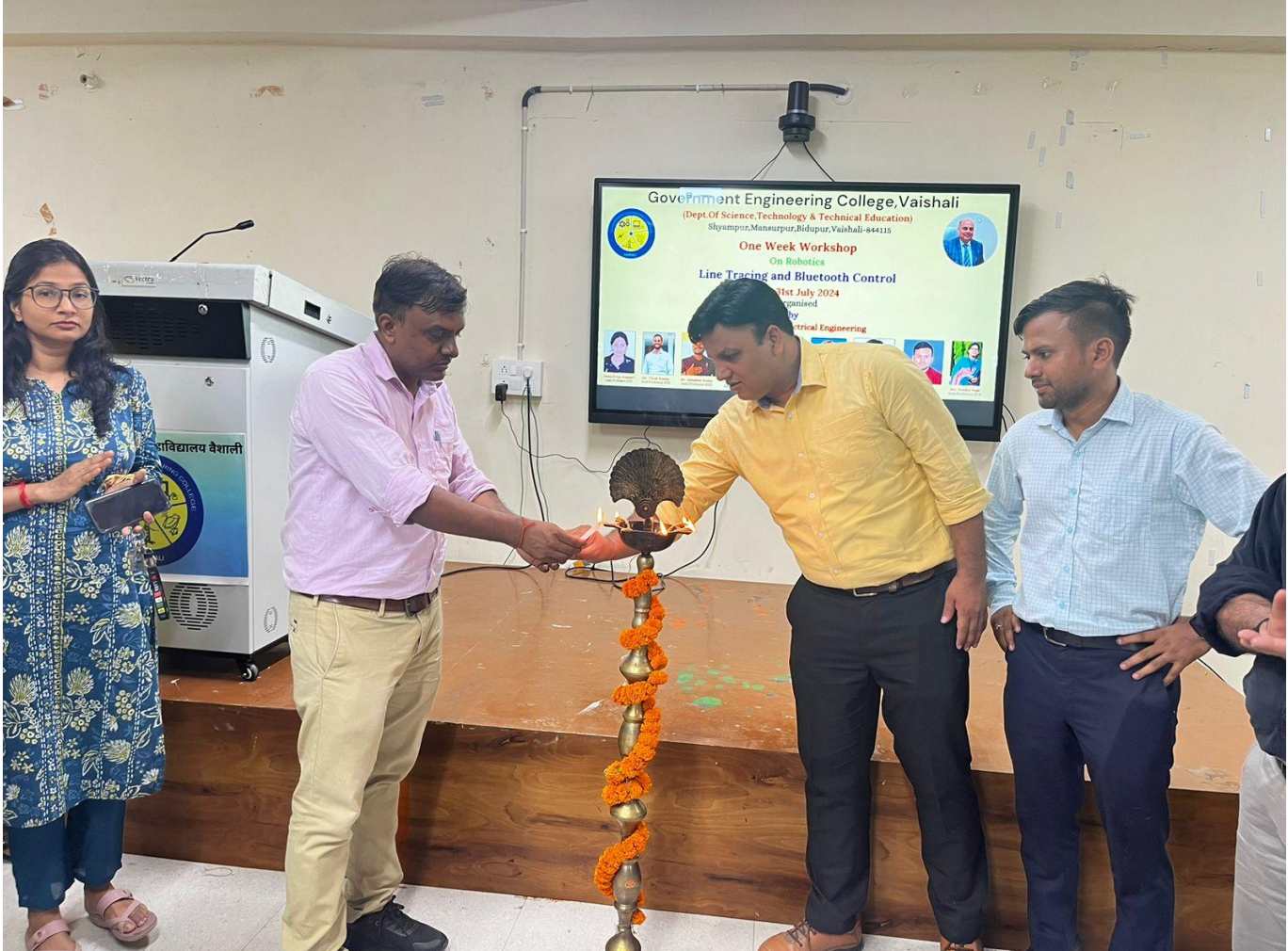
Inaugural Ceremony of Robotics Workshop on Line tracing and Bluetooth Control